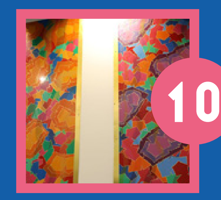
Image: Helen Frankenthaler, Grey Fireworks (detail), 2000, Screenprint Colors, 31 <sup>1</sup>/<sub>4</sub>" x 49"

Visit roanoke.edu/olingalleries for updates on viewing dates.