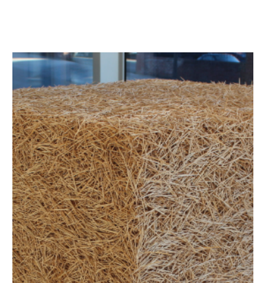
Tara Donovan. (American, born 1969) Untitled, 1996 (installed 2018). Detail Toothpicks