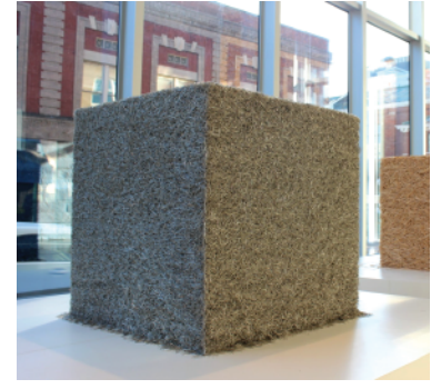
Untitled, 2004 (installed 2018) Straight pins Courtesy of an anonymous lender

Tara Donovan is an American sculptor who lives and works in Brooklyn, New York. Her large-scale installations, sculptures, drawings, and prints utilize everyday objects to explore the transformative effects of accumulation and aggregation. Known for her commitment to process, she has earned acclaim for her ability to exploit the inherent physical characteristics of an object in order to transform it into works that generate unique perceptual phenomena and atmospheric effects. Her work has been conceptually linked to an art historical lineage that includes Postminimalism and Process artists.